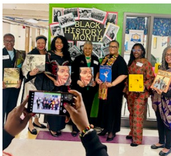
Read-In @ Gibson Elem.