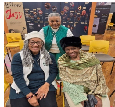
At the Jazz Museum