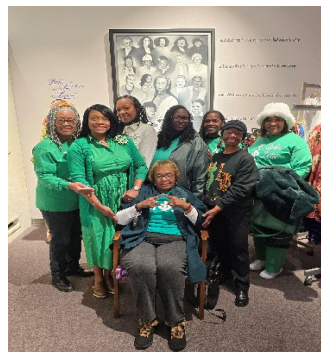
At the Griot Museum