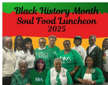
Soul Food Luncheon